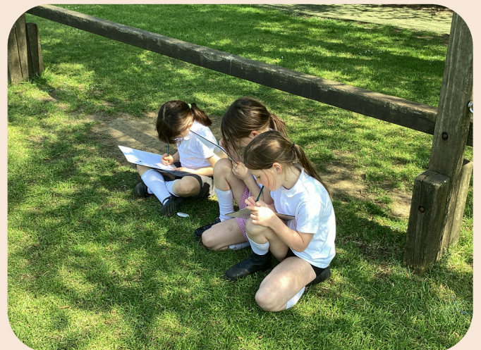
Fun in the sun! Willow Class enjoyed looking for objects in the school grounds that are living, dead, and have never been alive.