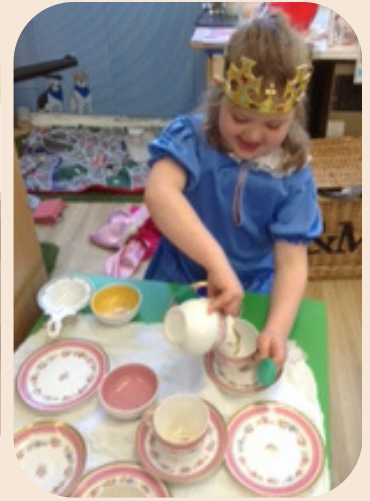
Acorn Class have been embracing their London topic!