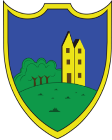
Bruton Primary School